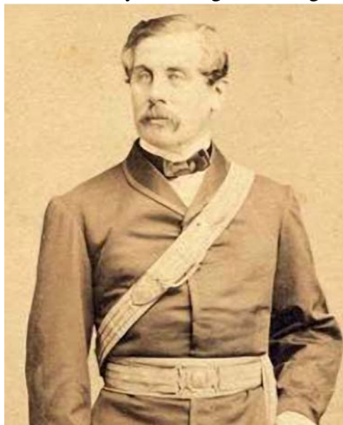
Thomas Francis Meagher

Most American still considered England a potential enemy at this time. Only five years earlier slogans in the United States were "All Oregon or None" and “Fifty-four Forty or Fight”. In 1848 England invaded Nicaragua and ceased San Juan. Fortunately war was avoided by the Clayton-Bulwer Treaty. Although Washington was concerned about Briton, it was also concerned about