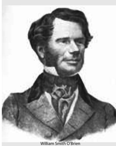
William Smith O'Brien

An “Irish Brigade of Young Ireland” was proposed in Dublin by William Smith O’Brien who, on 23 March 1848, made public his concept of an Irish Brigade to be raised in America comprised of Irish immigrants.